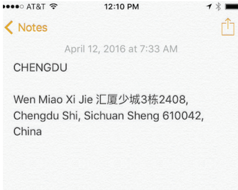
Erik Benjamins A group of elderly ramblers passed by our front door on the way to their hearth, 2016 digital capture

"Souvenirs are collected by individuals, while sights are collected by entire societies." 1