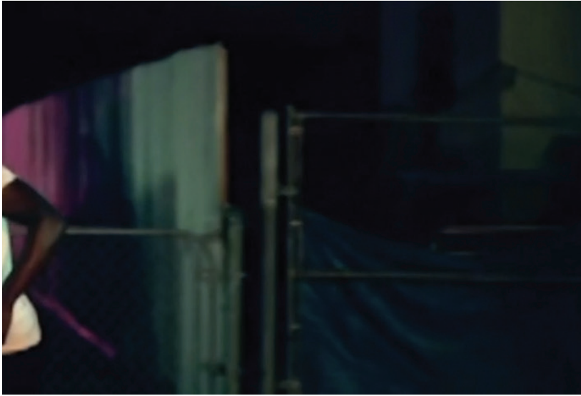
Sable Elyse Smith How We Tell Stories To Children still, 2015 single channel video Courtesy of the artist Copyright Sable Elyse Smith

looks like and what kind of people fill it. If our only proximity to a prison cell is through marathons of reality television and inmate penpals, just as if our only proximity to a given culture is through similar filters of mediation, then are we not all some form of cultural tourist? In critical response to this phenomenon, Benjamins' and Smith's works provocatively conjure elements of the "known" only to reveal the problematics of looking from such a removed distance, calling into question the viewers' privilege of being able to temporarily occupy a space in the realm of the Other. As such, these artworks also remind us that a position of exteriority, along with the luxury to move from place to place, implicitly bears the counter position of interiority and the inability to move within that same leisure and freedom.