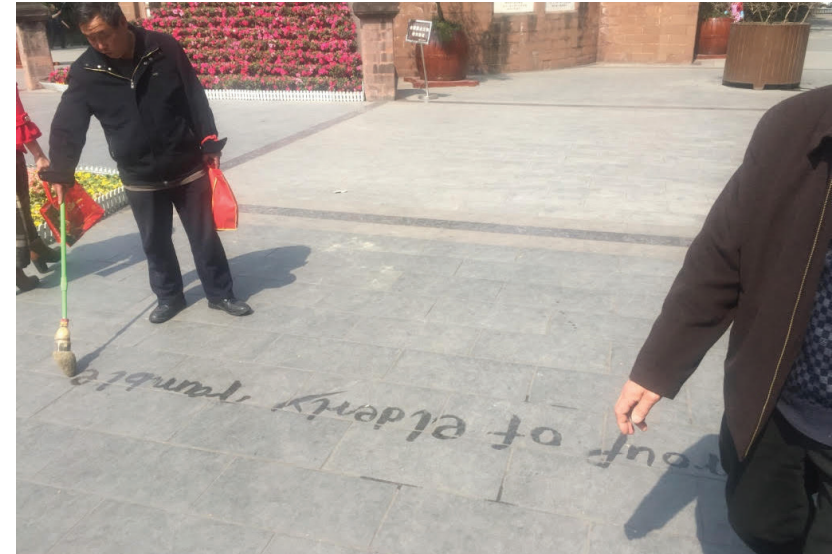
Erik Benjamins A group of elderly ramblers passed by our front door on the way to their hearth , 2016 digital image

Hailing from a site of quintessential exoticness from a Western standpoint, is Erik Benjamins' A group of elderly ramblers passed by our front door on the way to their hearth 5 (2016), a document of the artist's stay in Sichuan, China. The work employs texts and sound recordings produced concurrently in such a way that the texts function as navigational markers for the recordings that are in turn, meant to evoke one's imagination of the city. With the exception of the texts, the work includes no illustrative, pictorial, or image-based representations. Alternately, Sable Elyse Smith's video works, How We Tell Stories To Children (2015), untitled: Self-Portrait (2013), and Men Who Swallow Themselves In Mirrors (2016), draw upon familial relationships that exist within the radius of the American prison industrial complex 6 in order to break apart