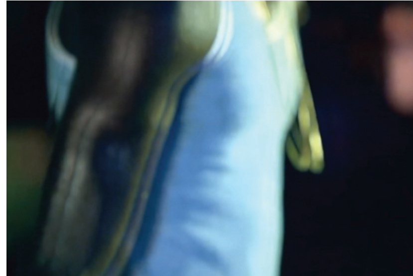
Sable Elyse Smith Men Who Swallow Themselves In Mirrors still, 2016 single channel video

when walking into a cafe is not necessarily one that needs to be developed, 8 takes on a multifaceted dimension.